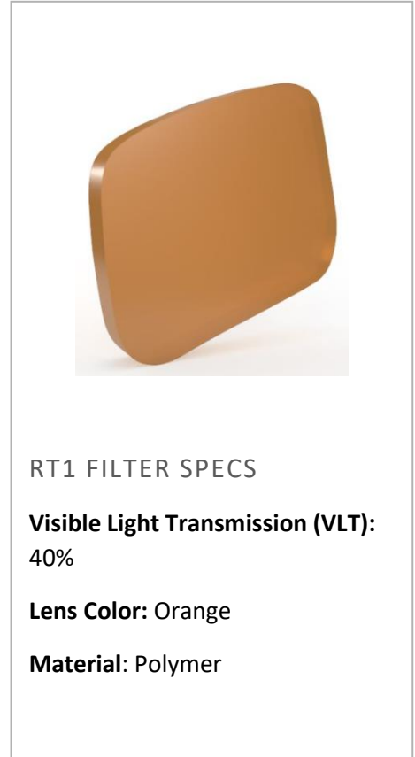
RT1 FILTER SPECS